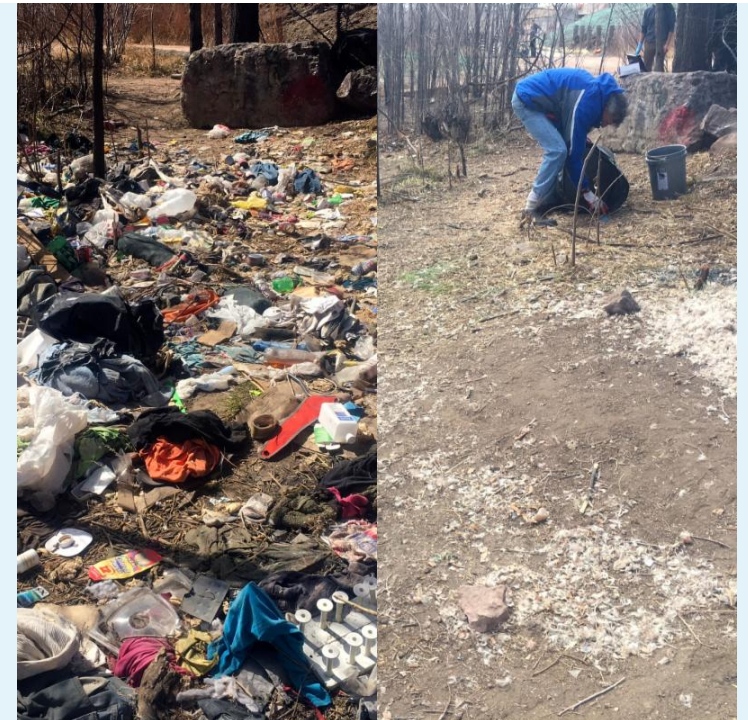
BEFORE (left) and AFTER (right) photos

Due to the amount of work, the volunteers ran out of time and plan on visiting the project site again on April 22 from 10 a.m. to noon.