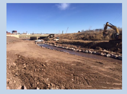
Upper Fountain Creek

This year's National Work Zone Awareness Week is April 3-7 and the theme is "Work Zone Safety is in Your Hands." The key message is for drivers to use extreme caution in work zones.