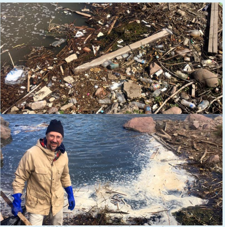
BEFORE (top) and AFTER (bottom) photos

UpaDowna is a Colorado Springs based 501(c)(3) nonprofit, who's mission is to provide access to outdoor adventures for all through events and programs that empower individuals, create healthier communities, and foster a respect for the environment.