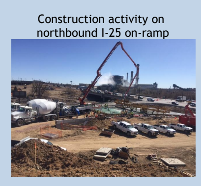
Upper Fountain Creek